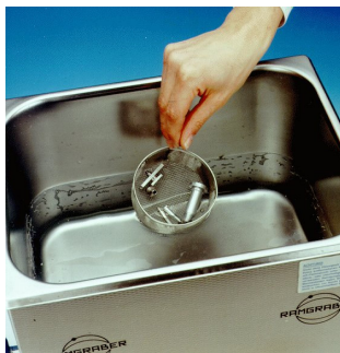
Cleaning of dispensing needles with ZESTRON® ES 200 in an ultrasonic tank