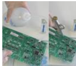
2) Rinse / Dry