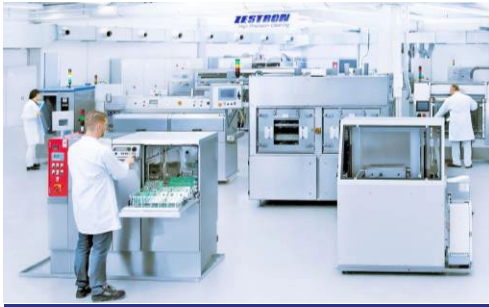
Machine Test Center