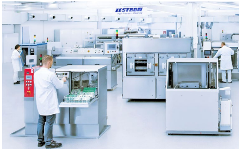
Machine Test Center